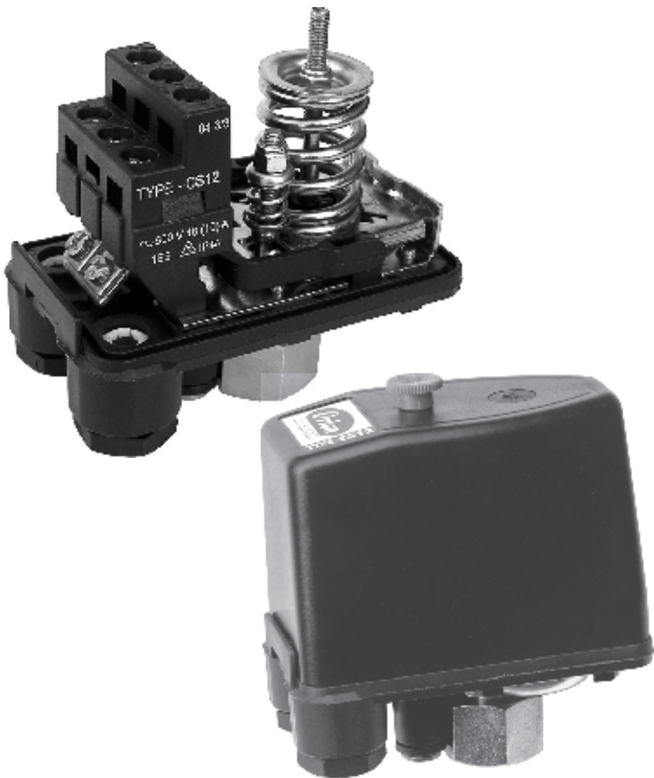
Range Selection Table